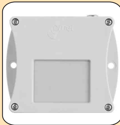
Single-channel thermometer P8511 for one cable probe DSTGL40/C