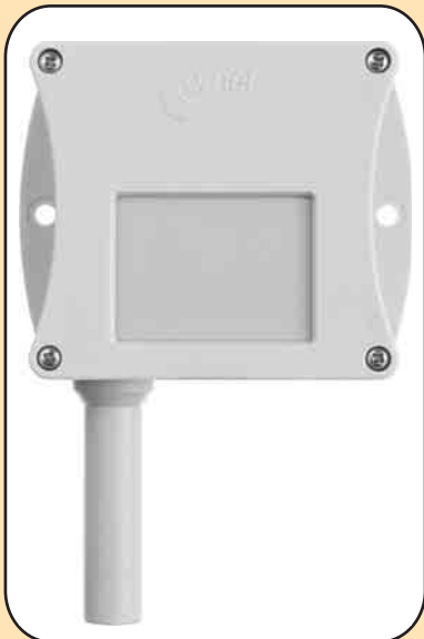
Thermometer P8510 with built-in temperature sensor