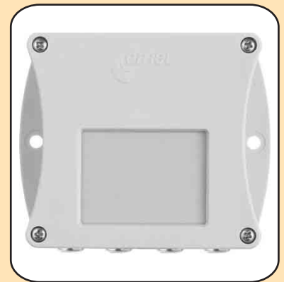
Four-channel thermometer P8541 for four cable probes DSTGL40/C