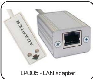
LPO05 - LAN adapter