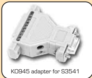
KO945 adapter for S3541