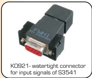
KO921 - watertight connector for input signals of S3541