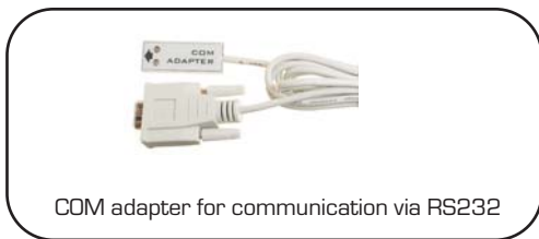
COM adapter for communication via RS232