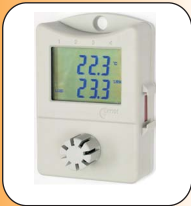
Thermometer hygrometer S3120