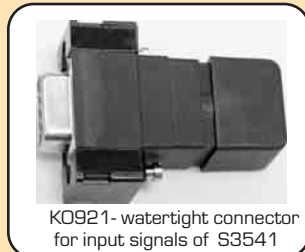
KO921- watertight connector for input signals of S3541