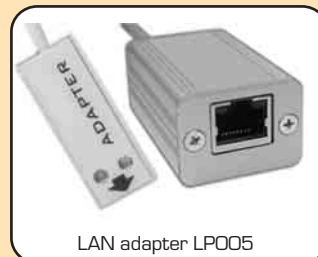
LAN adapter LP005