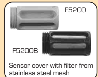
F5200 F5200B Sensor cover with filter from stainless steel mesh