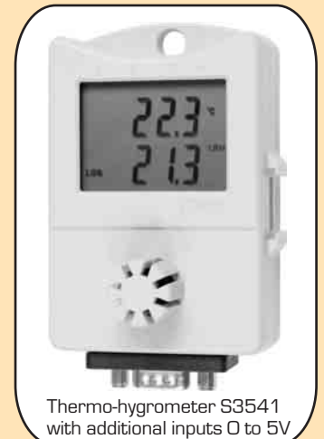
Thermo-hygrometer S3541 with additional inputs 0 to 5V

No accessory is included. For basic use it is necessary to order at minimum a COM adapter or USB adapter for communication with computer, optionally a start/stop magnet, if needed to control logging the other way than directly from computer. Also connector for input signals connection is necessary to order - only model S3541.