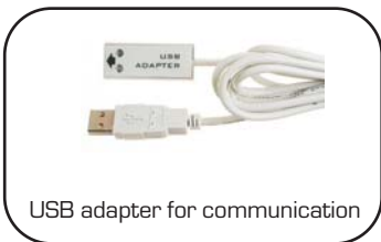
USB adapter for communication