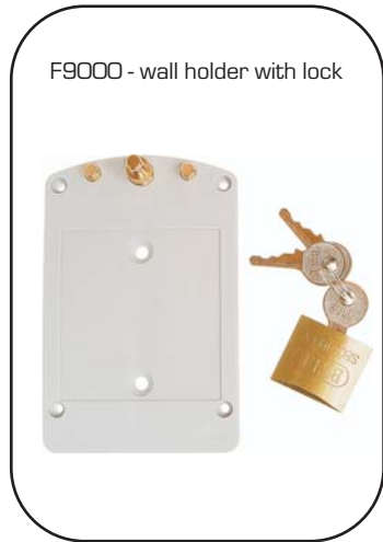
F9000 - wall holder with lock