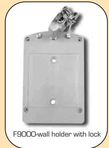
F9000-wall holder with lock