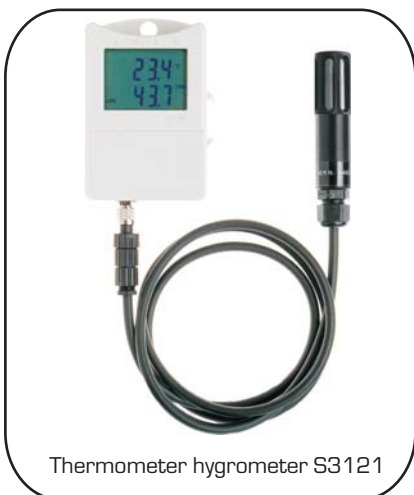
Thermometer hygrometer S3121