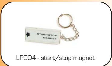
LPO04 - start/stop magnet