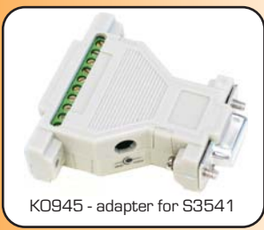
KO945 - adapter for S3541