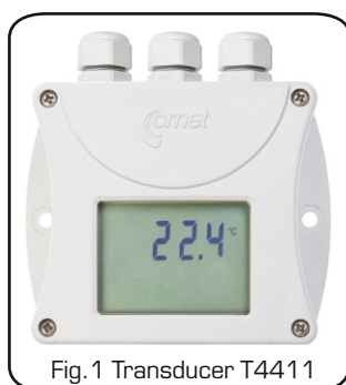
Fig. 1 Transducer T4411

1) Maximum temperature only at the measuring end with sensors. Maximum temperature +105 °C is allowed also for the cable. Relative humidity at temperature over +85 °C is limited in accordance with the graph. Near plastic case with electronics maximum temperature is +80 °C.