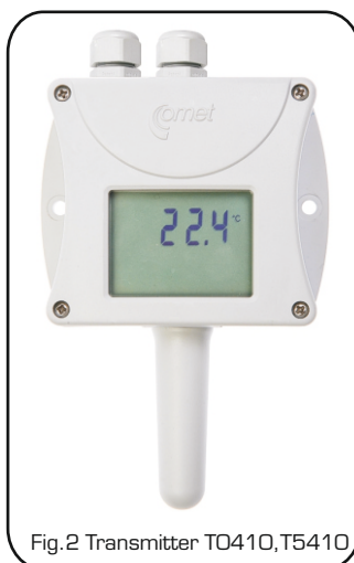
Fig. 2 Transmitter T0410, T5410