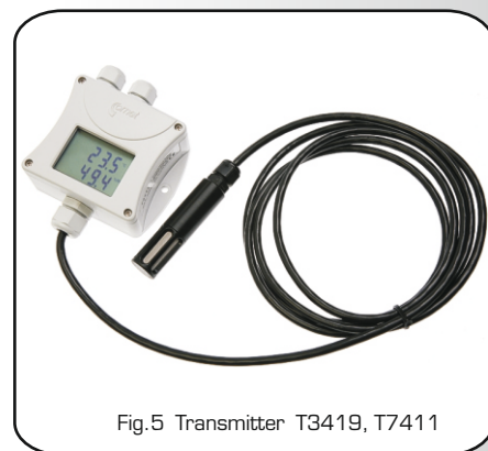
Fig. 5 Transmitter T3419, T7411