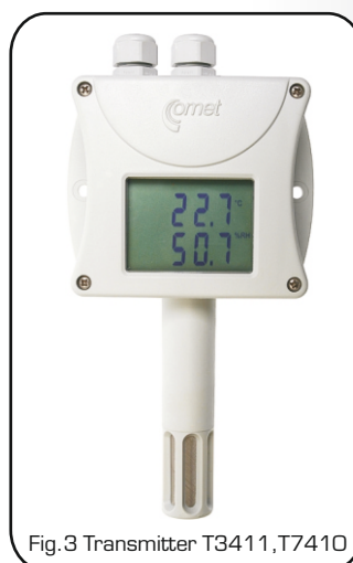
Fig. 3 Transmitter T3411, T7410