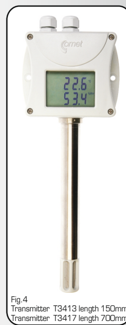
Fig. 4 Transmitter T3413 length 150mm Transmitter T3417 length 700mm