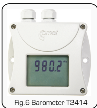
Fig. 6 Barometer T2414